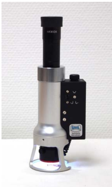
MS1-504 + MS1-504R

The adjustable LED illumination control with rechargeable battery is available as premium solution.